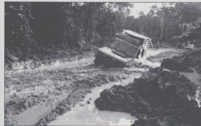
Figure 7. Slogging through axle-deep mud, one of the Expedition's eight Land Rover Discoverys maneuvers a tough leg of the 400-mile trek through Belize and Guatemala. The replicas were first air-freighted to Belize City, where one of Stela 5's replicas was presented to the Belize Government for public display. The Expedition group then set out for a rough-riding journey that carried the remaining replicas to Caracol. Land Rover North America provided the vehicles and sponsored the Expedition, in cooperation with La Ruta Maya Conservation Foundation and in consultation with The Nature Conservancy. Additional support was provided by Altitude Marketing, Caterpillar Logistics Services, Coleman, Comsat Mobile Communications, Hella, Magnavox Nav-Com, Michelin, and Warn Industries.