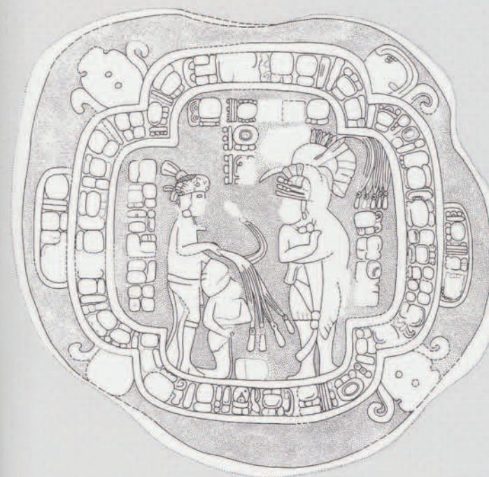
Figure 3. In A.D. 820, two hundred years after Stela 5 was erected, Altar 13 was carved and set in the plaster floor of a public plaza at Caracol. Altars and stelae were often paired, but this one, like Stela 5, appears to have stood alone.

On the left of the central scene, two figures, one standing and one kneeling below a feather wand, gaze at the more elaborately clothed figure to the right, who was probably Caracol's current ruler. Severely eroded traces of royal titles such as the bacab at the upper right and lower left corners of the frame point to the name glyphs of the figure and a possible reference to his parents. The scene is enclosed by a four-lobed frame used in glyphic writing as a symbol both for the completion of a cycle and for the world with its four directions.