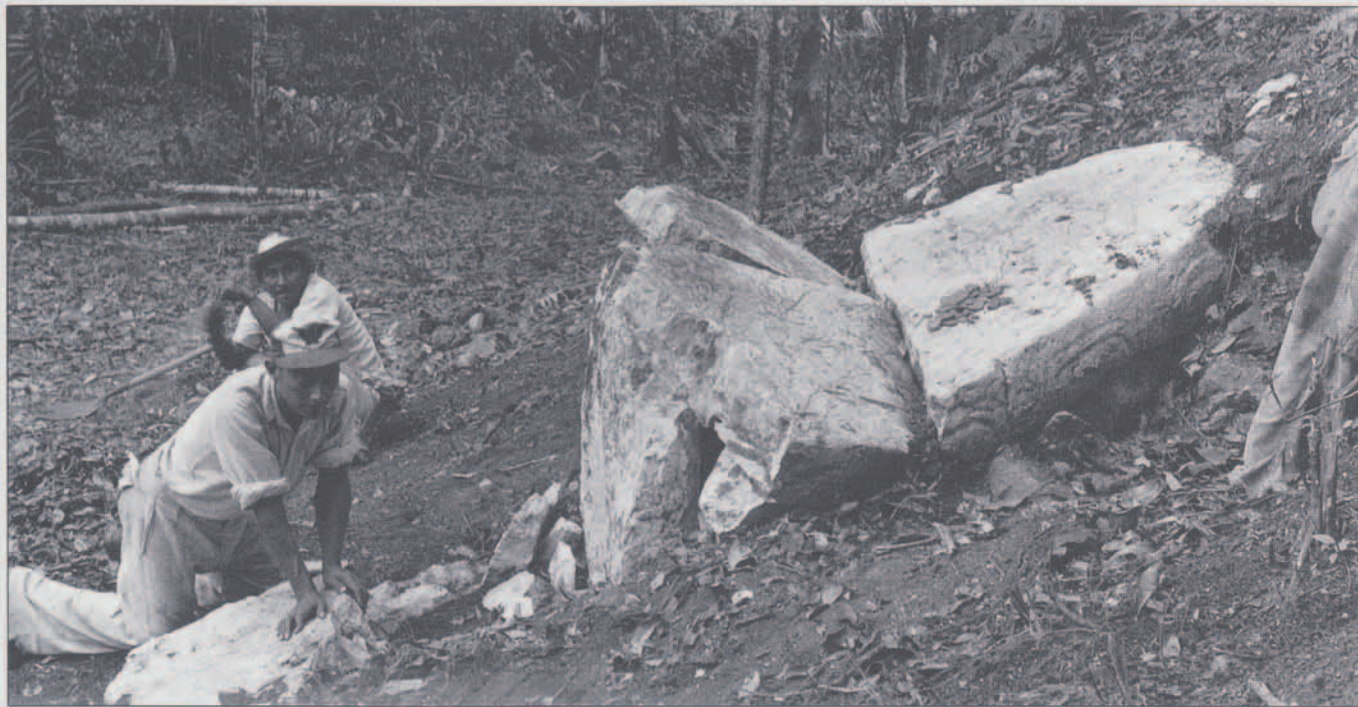
Figure 4. Stela 5 in situ in 1951, after preliminary clearing but before excavation. In the course of time, the stela had fallen backward and split vertically and horizontally. Altogether 8 large pieces and 46 chips and flakes were selected for shipment to Philadelphia; the uncarved back was left in Belize. The monument's exact location was recorded before the pieces were lifted and crated for shipment. The reassembled stela now stands in the Museum's Mesoamerican Gallery.

The University Museum's survey and excavations at Caracol were carried out jointly with the government of British Honduras, as Belize was then called. When a division of the finds was made, the Museum took mostly broken monuments because it had the facilities to conserve and reconstruct them. Those that were still intact stayed in British Honduras.