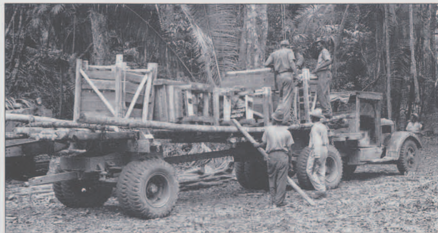
Figure 5. Logging trucks operated by a local mahogany contractor carried the monuments, secure in their custom-made boxes and "pressure-crates," out of the jungle to loading docks in Belize City. United Fruit Company shipped them on to New Orleans whence they were transferred for their final journey by rail to Philadelphia.