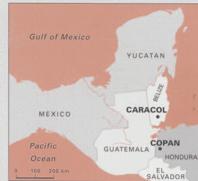
Figure 2. Map showing the Classic Maya sites of Copan in Honduras (see next article) and Caracol in Belize (formerly British Honduras).

The University Museum intended to continue its research at Caracol, and indeed returned for another season in 1953. By 1956, however, the new discoveries at Tikal eclipsed the Caracol project and absorbed all of Satterthwaite's time. Not until the 1980s were full-fledged excavations at Caracol once again undertaken. Under the directorship of Arlen and Diane Chase, archaeologists at the University of Central Florida, these new explorations make it clear that Caracol was one of the largest centers of the lowland Maya and a serious rival to the great city of Tikal. They also make it clear that potential destruction of monuments by natural and