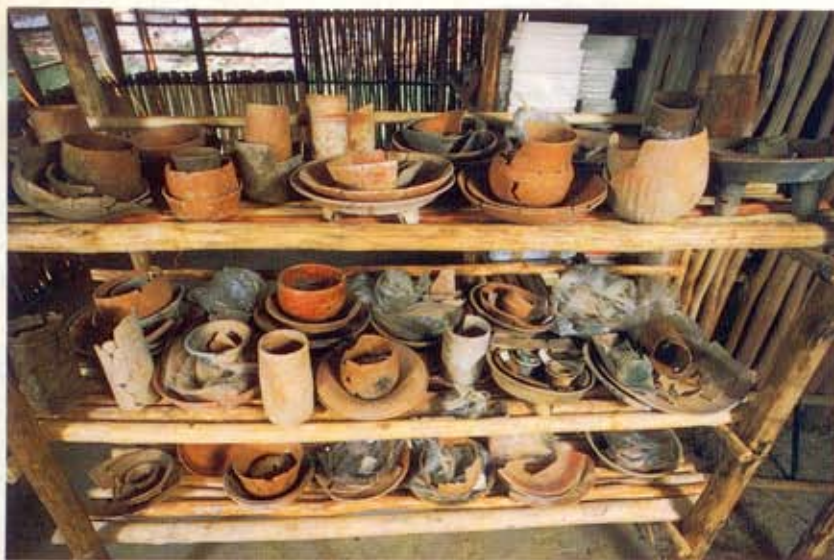
Some of the thousand ceramic vessels recovered at Caracol since the project began in 1985 are stored on shelves in the main lab.

Murals of this period at Chichén Itzá show houses being sacked, their thatched roofs in flames. Rebuilding was next to impossible for large populations living at the ecological limits of the environment. "The Maya