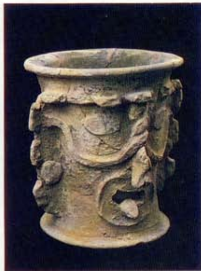
Terminal Classic incense burner is fashioned to represent sun at night.