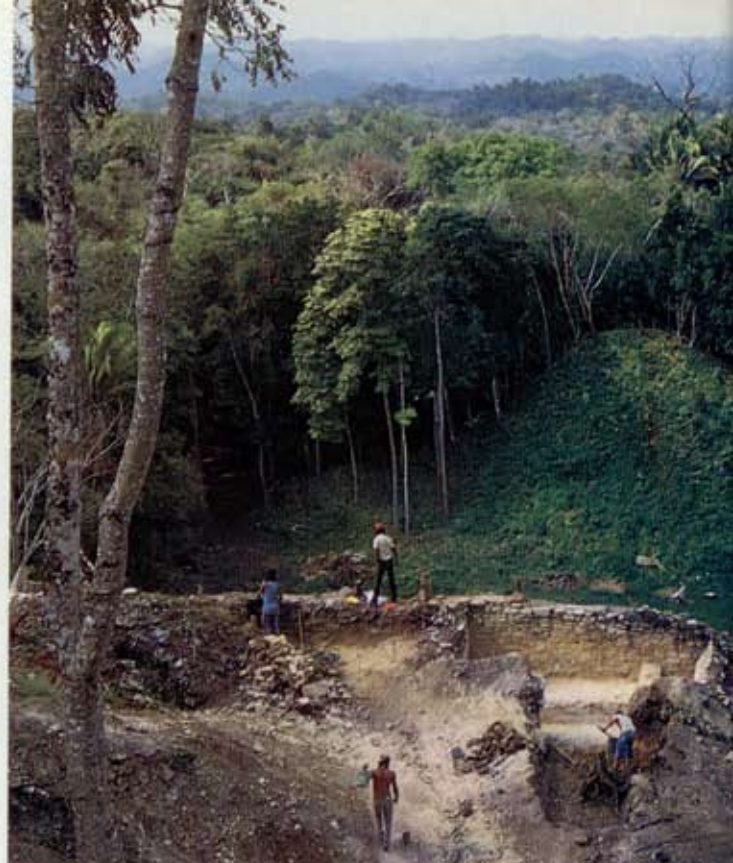
Chases and staff (center) excavate within a medial door, formal entrance to the architectural complex.