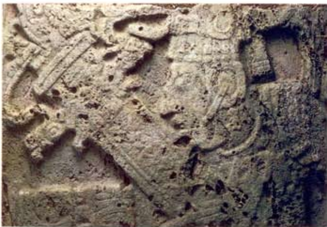
Figure with headdress and ear flares characteristic of a Maya lord holds ceremonial bar, a sign of rulership.

been painted on the back wall, and broad stripes of red swept around the tomb walls and climbed the south corners, framing the entrance."