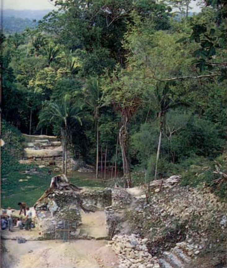
Workmen (at left) are removing rubble from the sacred precinct; site extends far beyond the first ridge.