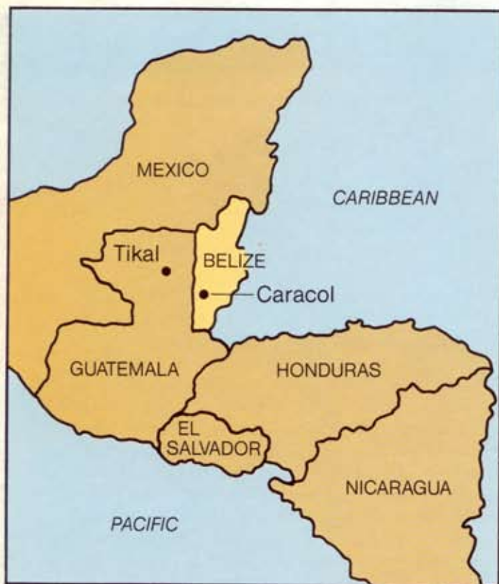
Map shows the relationship of Caracol, deep in the Belizean jungle, to its archenemy, Tikal.