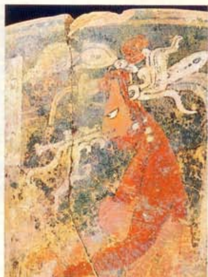
Classic cylinder with woman's figure is from the outskirts; here, a detail.