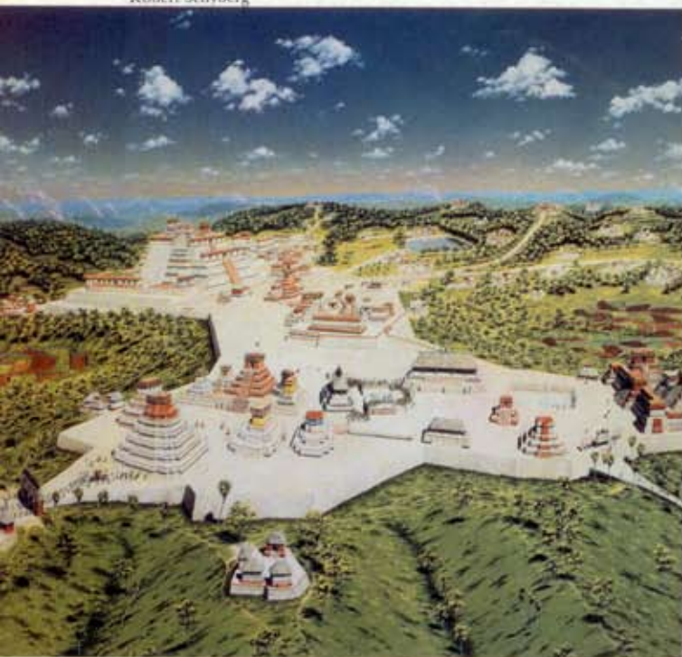
Partial excavation of Caracol's epicenter was basis for this model; the built areas extended much farther.