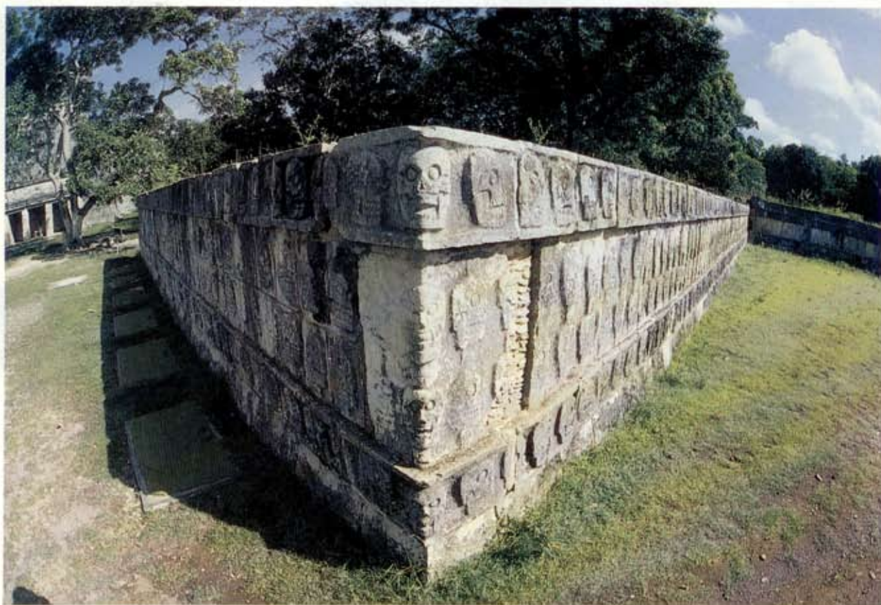
Tzompantli platform at Chichén Itzá shows four tiers of relief-carved skulls from the Terminal Classic.