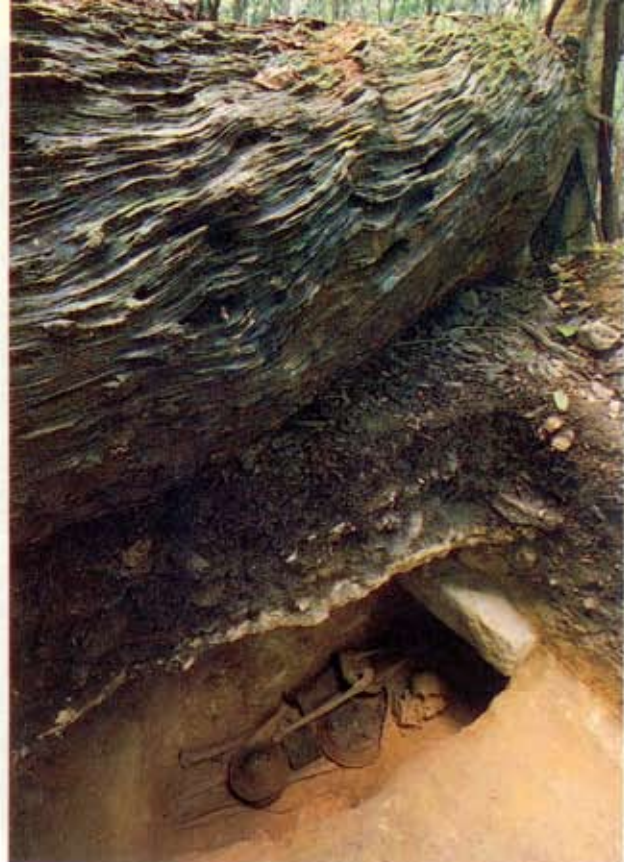
This crypt, 2.5 kilometers from epicenter, entombed two adults, indicating they were not among the elite.

with representations of humans and animals; ball courts and broad plazas; tombs furnished with exquisite jewelry and elaborate ceramics. The Maya devised the most complex system of writing developed in the Americas; a form of astronomy; a calendar; a mathematical system that included the concept of zero; and an extensive court etiquette. And then came collapse of the political system along with abandonment of the major Classic cities.