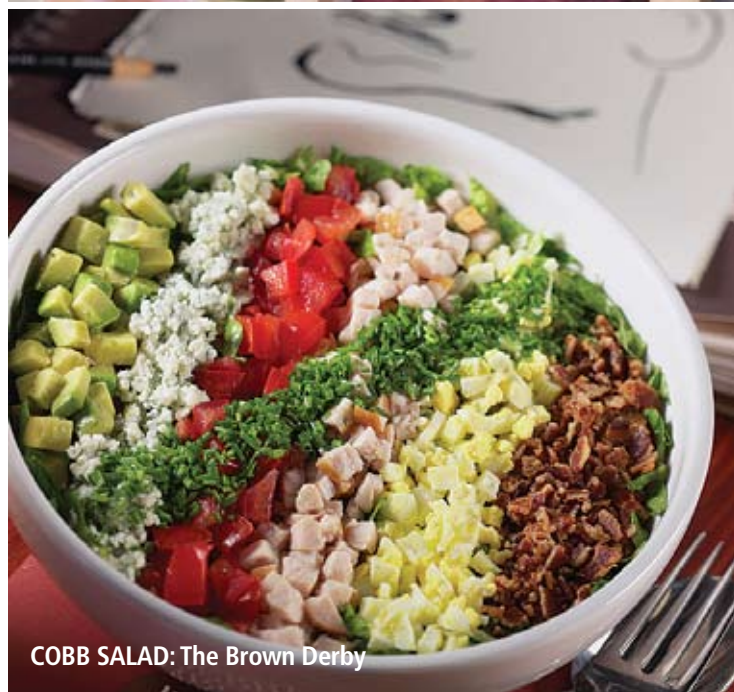
COBB SALAD: The Brown Derby