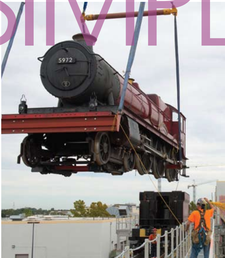
NEW TRAIN(S): Hogwarts Express and SunRail