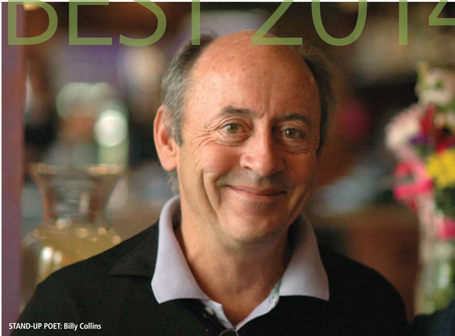
STAND-UP POET: Billy Collins