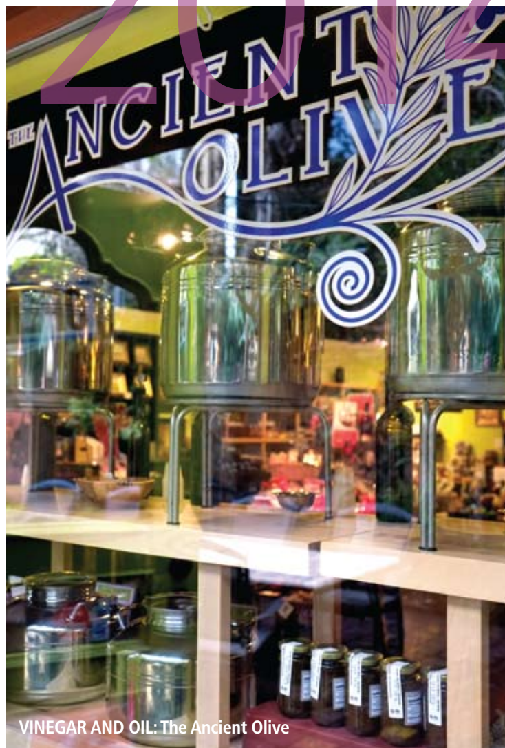
VINEGAR AND OIL: The Ancient Olive

The lavash at Bosphorous (two locations) arrives as an enormous, steaming pillow and has a welcome heartiness even after it deflates. It's the ideal heft for the twin restaurants' Turkish appetizer spreads. bosporousrestaurant.com