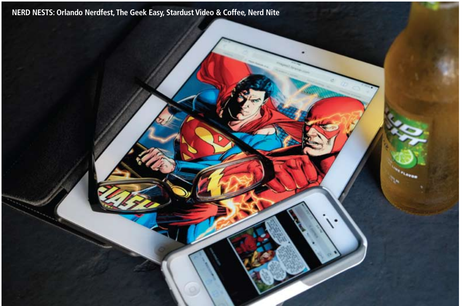
NERD NESTS: Orlando Nerdfest, The Geek Easy, Stardust Video & Coffee, Nerd Nite

Two commuter trains make their Central Florida debuts this year, one for harried commuters and another for Harry commuters. Both are meant to link passengers to a bustling city, and both will have a lot riding on them. There's the Hogwarts Express ( universalorlando.com/harrypotter ) which in the Harry Potter series of fantasy novels connects downtown London — specifically Kings Cross Station