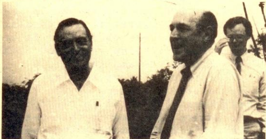
PRIME MINISTER PRICE AND AMBASSADOR SHLAUDEMAM

The US Special Envoy for Central America, Mr Harry Shlaudeman made a brief visit to Belize on Tuesday, July 17.