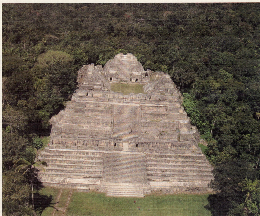
Caana - 2004