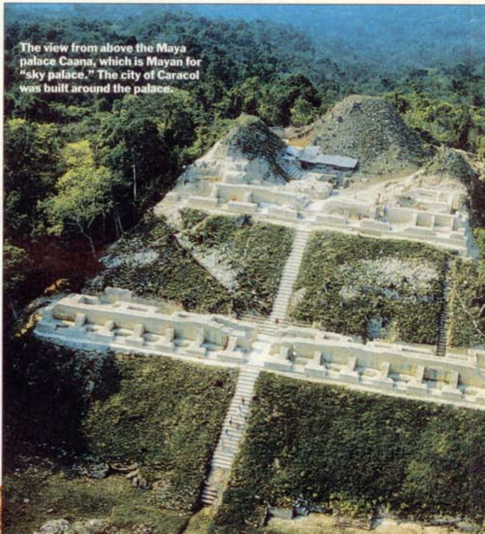
The view from above the Maya palace Caana, which is Mayan for "sky palace." The city of Caracol was built around the palace.

While in Belize, the Chases live in a hut without running water and sleep in